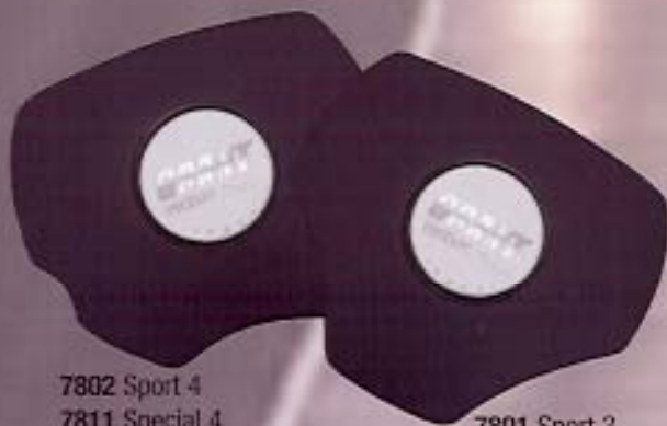
7802 Sport 4