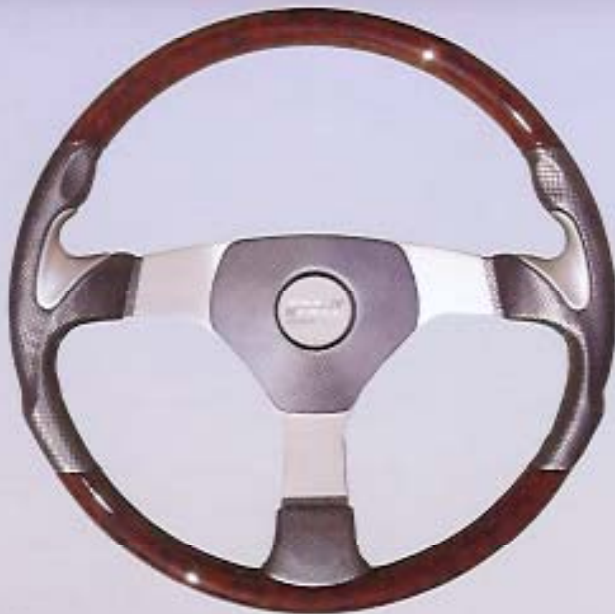
51012 Pathfinder 3 Model Fibertech 3 Spoke Horn Pad