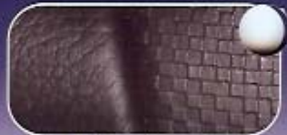
Leather & Polyurethane Hand Grips