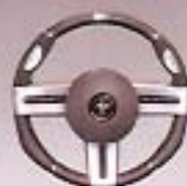
AIR BAG SOLUTIONS

Grant manufactures steering wheels to serve a wide selection of vehicles and interests.