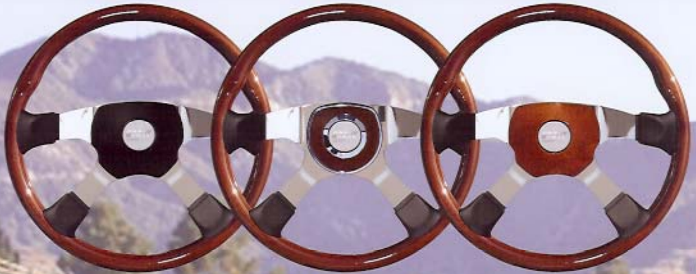
62002 Tour 4 Model Black Polyurethane 4 Spoke Horn Pad