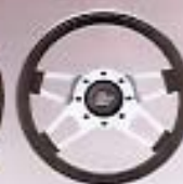
CLASSIC CAR & TRUCK