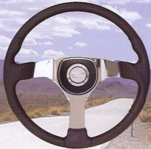
40004 Fleet 3 Model Chrome Accented Black Polyurethane Universal Horn Pad