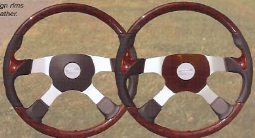
51702 Pathfinder 4 Model Black Polyurethane 4 Spoke Horn Pad