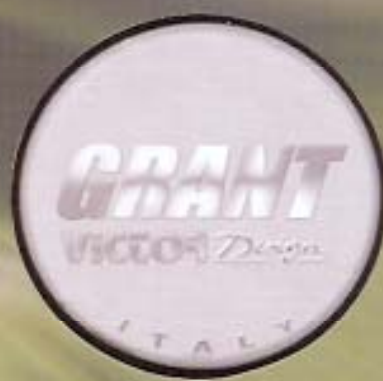
5900 Grant Victor Design Button