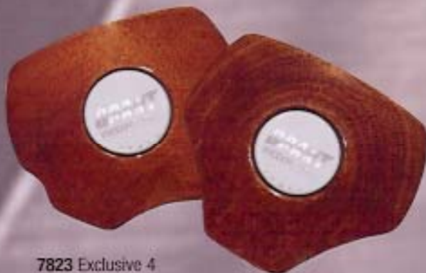
7823 Exclusive 4