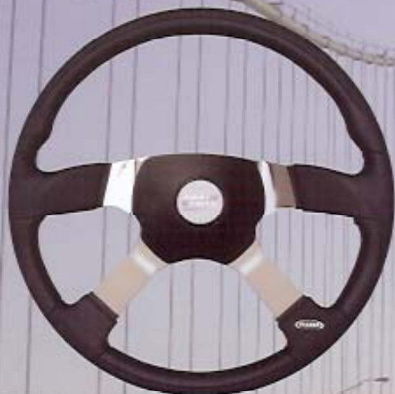
10502 Trucker 4 Model Black Polyurethane 4 Spoke Horn Pad