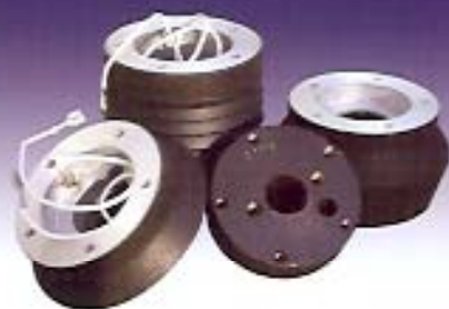
BLACK FINISH KITS

By separating the Installation Kit from the steering wheel, Grant allows its distributors to maintain a more efficient inventory, at the same time giving the end user the freedom upgrade to a newer Grant Steering Wheel without tampering with the delicate spline of the steering column. Drivers also gain the ability of taking their Grant wheel with them to a new Truck or Motorhome by only purchasing a new adaptor.