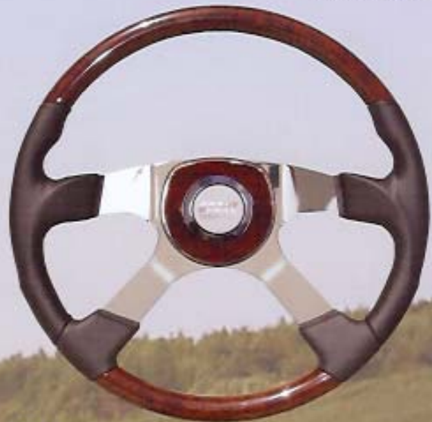
50521 Startruck 4 Model Chrome Accented Burl Universal Horn Pad