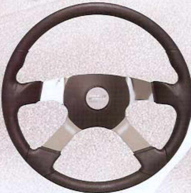
40502 Fleet 4 Model Black Polyurethane 4 Spoke Horn Pad