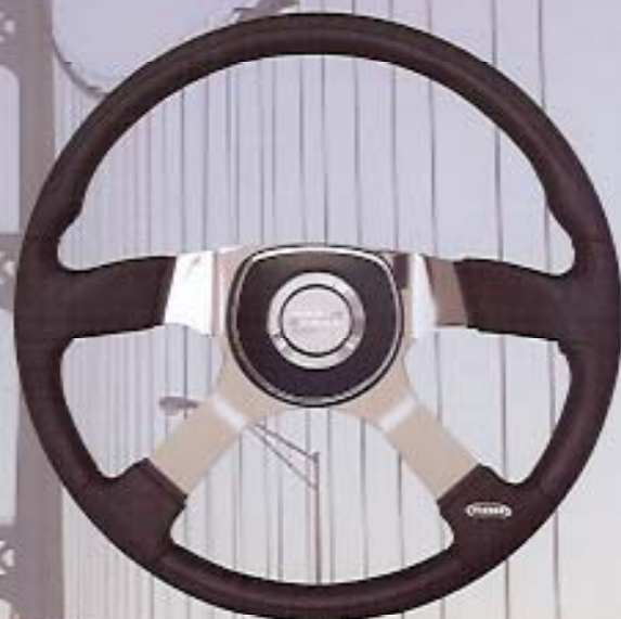
10504 Trucker 4 Model Chrome Accented Black Polyurethane Universal Horn Pad