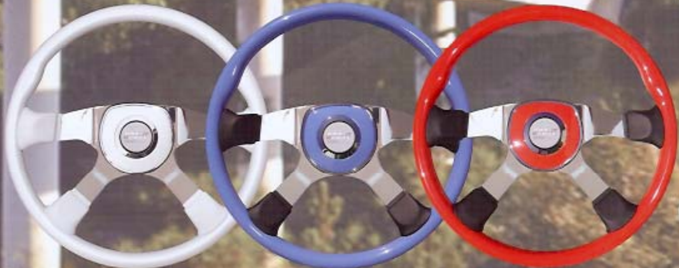
63030 Tour America Model Pearl White

To salute the Spirit of America these Tour 4 Wheels are offered in bright red, pearl white or royal blue. The wheel rims are genuine mahogany wood with a custom paint and a high gloss finish. The wheels feature a matching horn pad with chrome accents. The spoke accents are genuine leather.