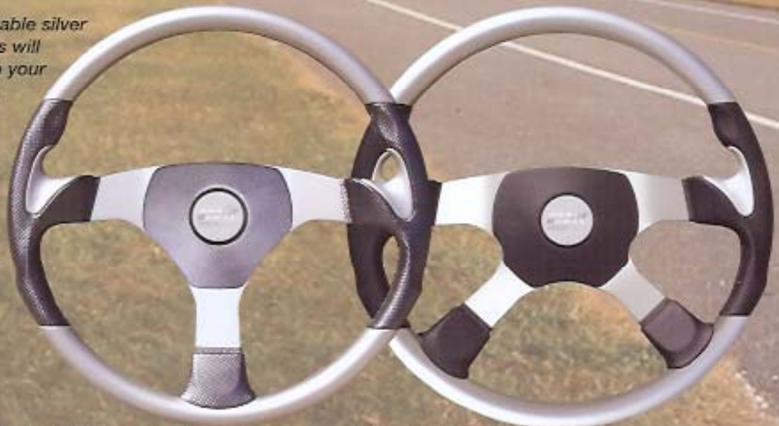
60012 Pathfinder 3 Model Fibertech 3 Spoke Horn Pad