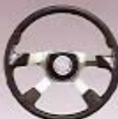
HEAVY DUTY TRUCK