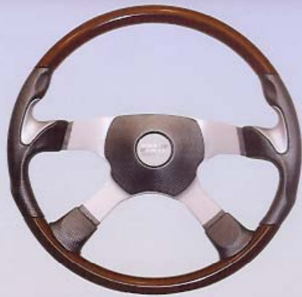
51513 Pathfinder 4 Model Fibertech 4 Spoke Horn Pad