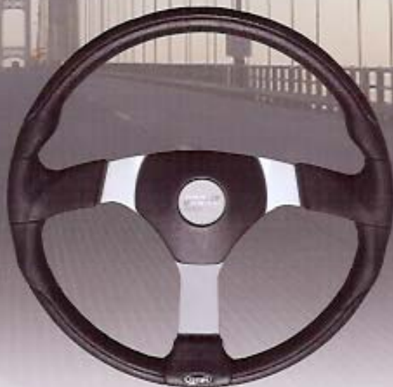
10001 Trucker 3 Model Black Polyurethane 3 Spoke Horn Pad