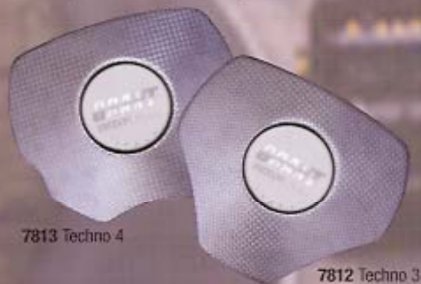
7813 Techno 4