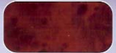
Burlwood look Rim