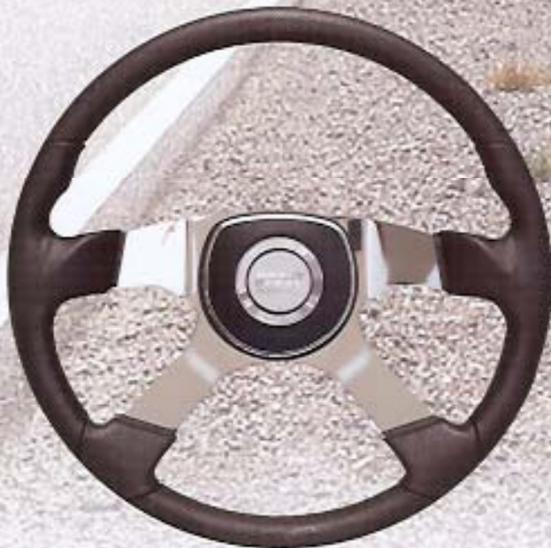
40504 Fleet 4 Model Chrome Accented Black Polyurethane Universal Horn Pad