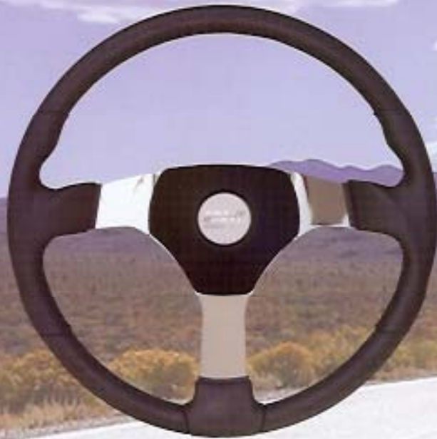
40001 Fleet 3 Model Black Polyurethane 3 Spoke Horn Pad