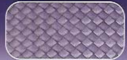
Close-up of Fibertech material