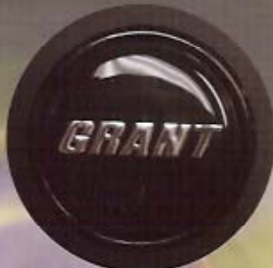
5883 Grant Button