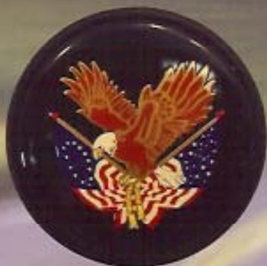
5905 American Eagle Button