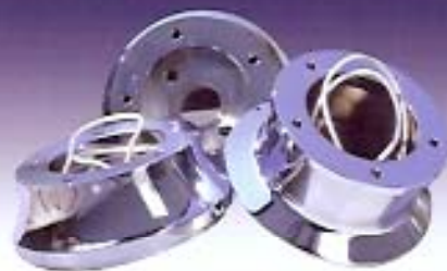
CHROME FINISH KITS