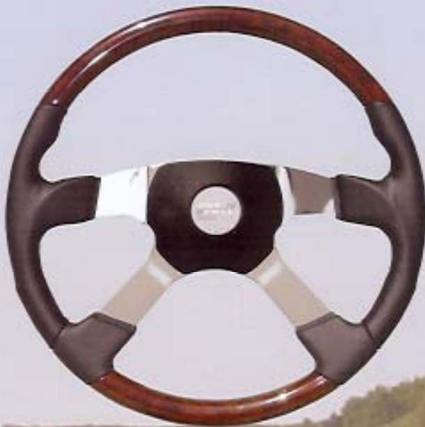
50502 Startruck 4 Model Black Polyurethane 4 Spoke Horn Pad